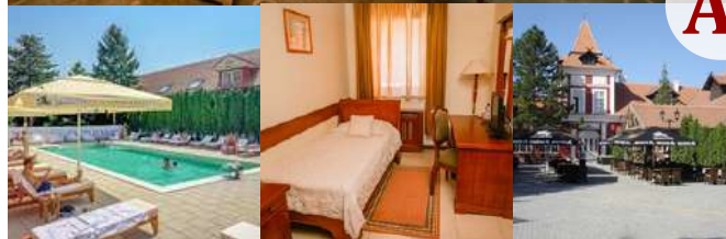
Located 6 km from the competition venue, surrounded by nature with a peaceful atmosphere.