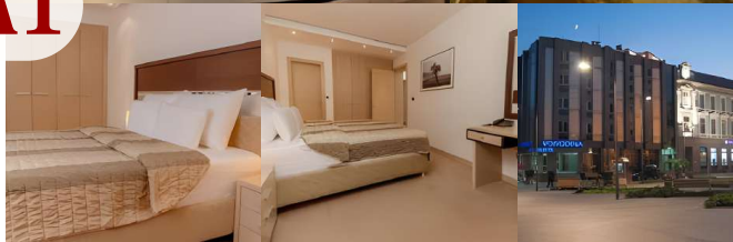
City center, 10 minutes walking distance from the competition hall, 3 minutes by car.